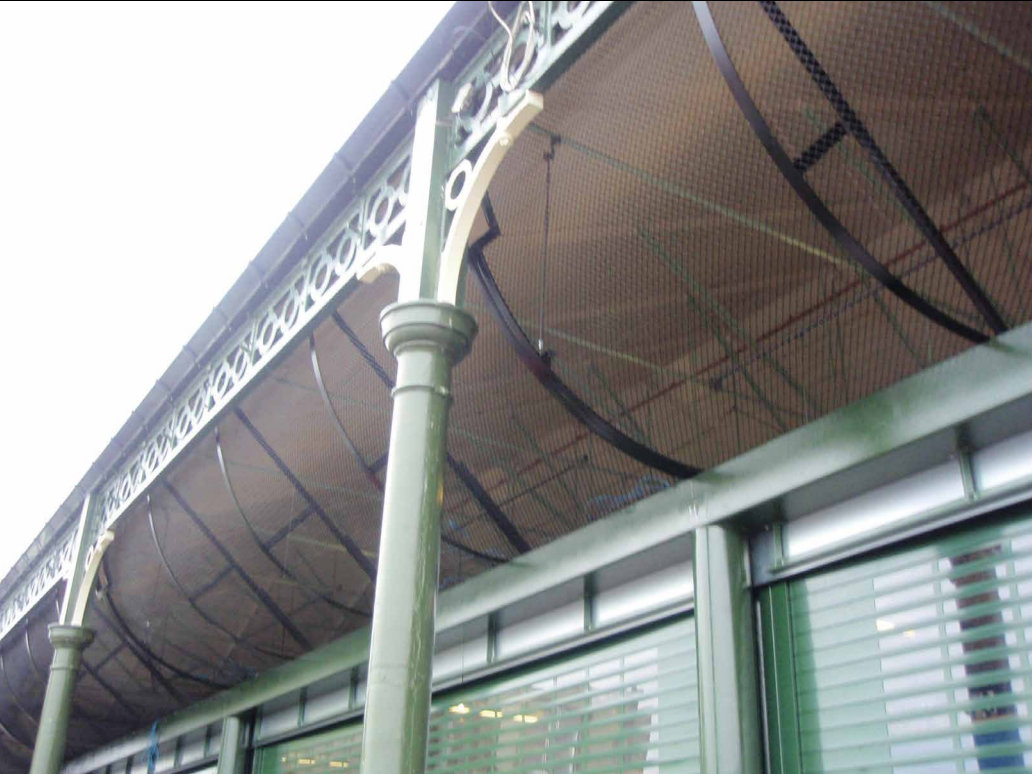
Doncaster Wool Market