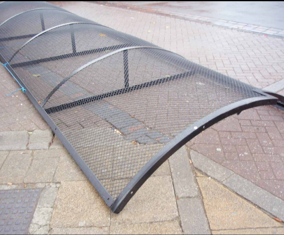
Doncaster Wool Market